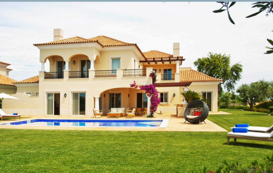
TWIN VILLA 4 BEDROOMS, PRIVATE POOL & GARDEN