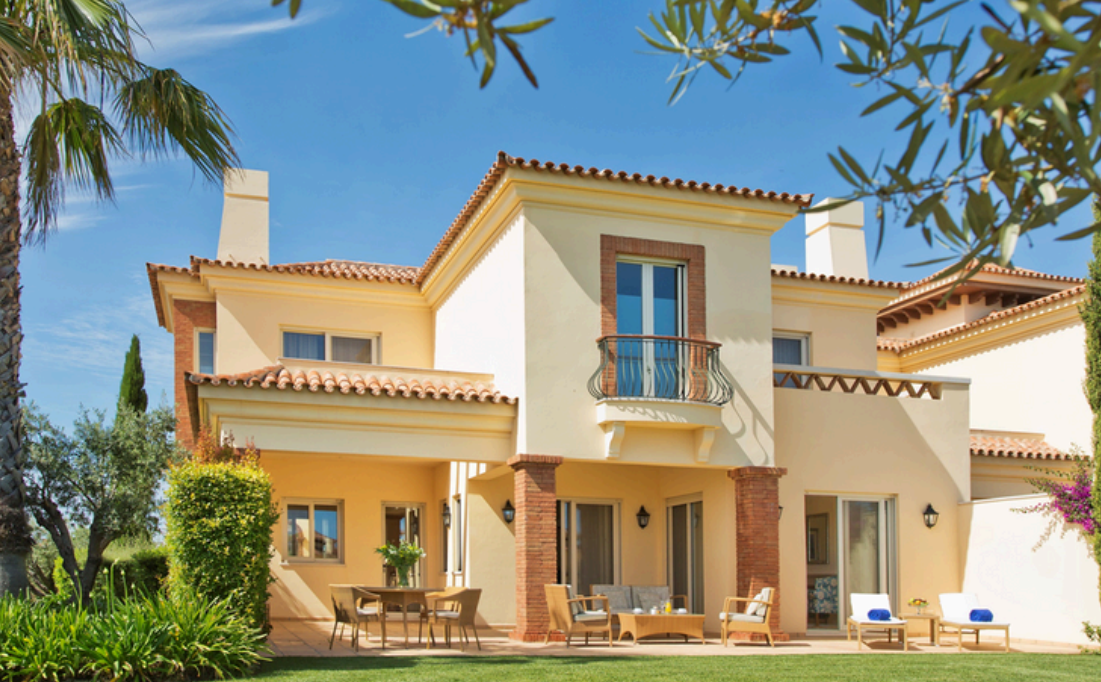
LINKED VILLA 2 & 3 BEDROOMS