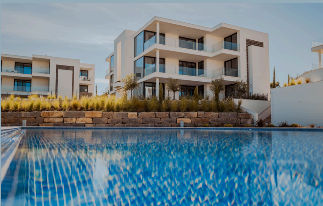
CLUBHOUSE RESIDENCES 1, 2 & 3 BEDROOMS